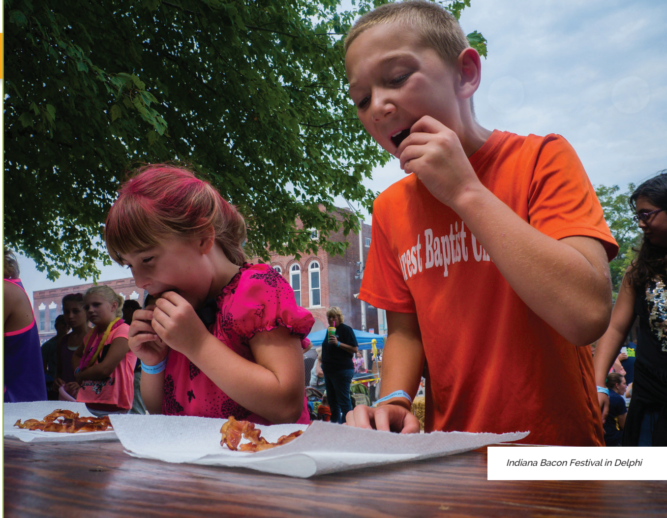
Indiana Bacon Festival in Delphi