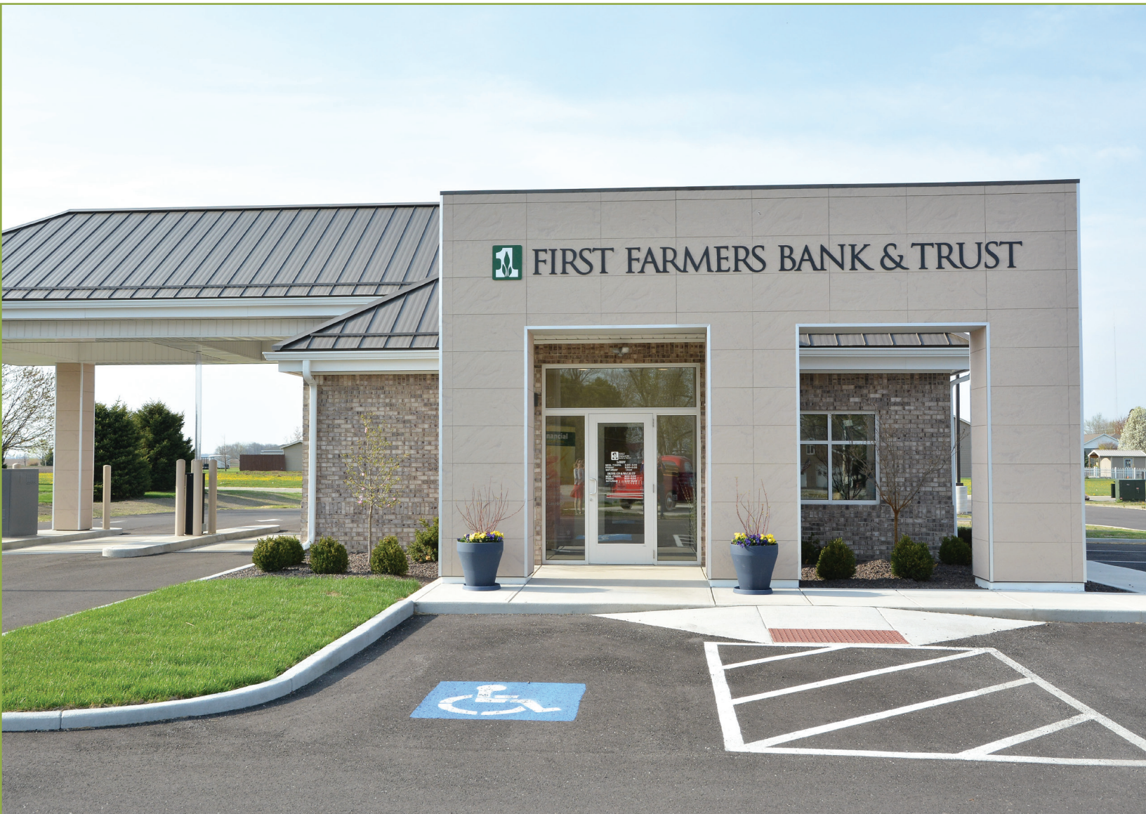
First Farmers Bank and Trust opened its first branch in Carroll County in 2017. The project is one of several new development's on Flora's east side.

Lafayette Bank & Trust Co. McCammack Quirk Investments & Financial Services Regions Bank Salin Bank & Trust Security Federal Savings