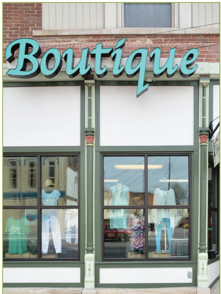
The retail in Downtown Delphi further diversified when Urban Chique Boutique opened in 2017 with women's clothing in a wide range of sizes.

Sisson & Sons Jewelry Stephan's IGA Times Past Antiques Trade Ways Treasures in the Woods Tri Green Tractors Trudy's Bridal and Formalwear True Value Home and Farm Center Urban Chique Boutique Wallman's Quality Foods Westside Motors Wilcox Lumber