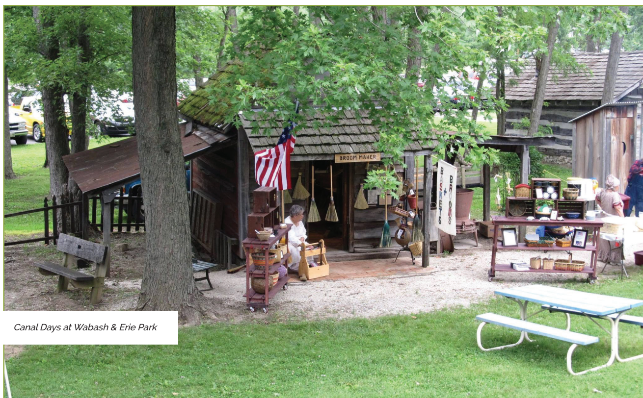
Canal Days at Wabash & Erie Park