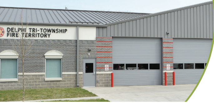
Delphi Tri-Township Fire Territory opened its new station in 2017 in Downtown Delphi.