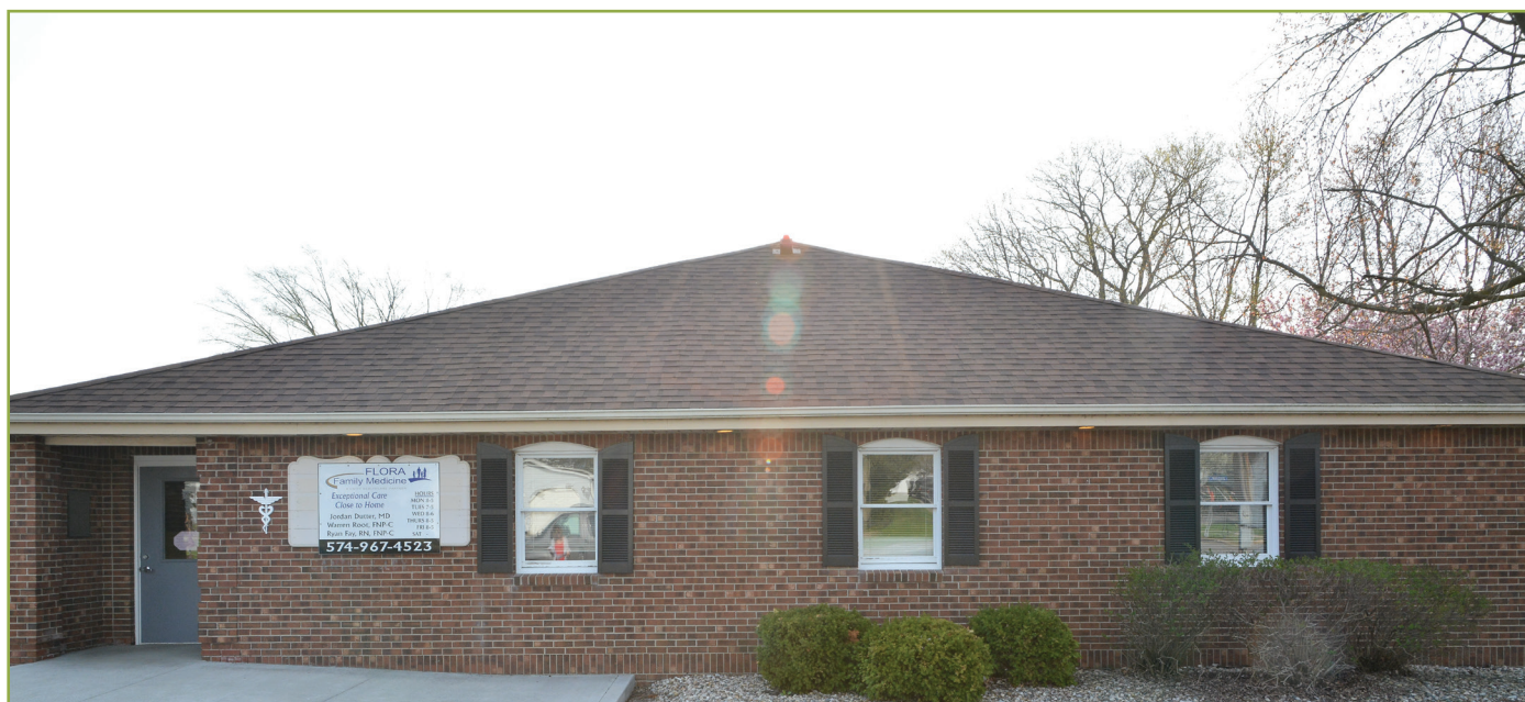
Flora Family Medicine is affiliated with Unity Healthcare. The practice provides comprehensive care for patients of all ages.