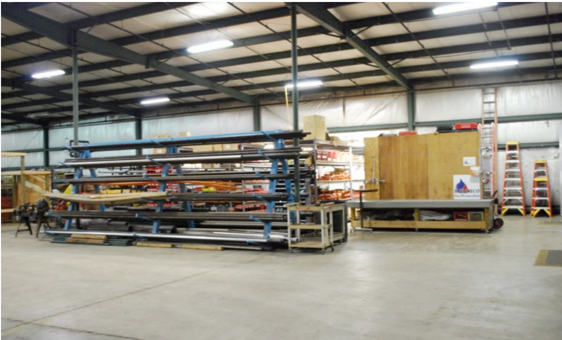
View of suite 11. This suite has 12,123 SF of space and a center ceiling height of 18'.

For more information, contact: Carroll County Economic Development lwalls@carrollcountyedc.com , 765-564-2060