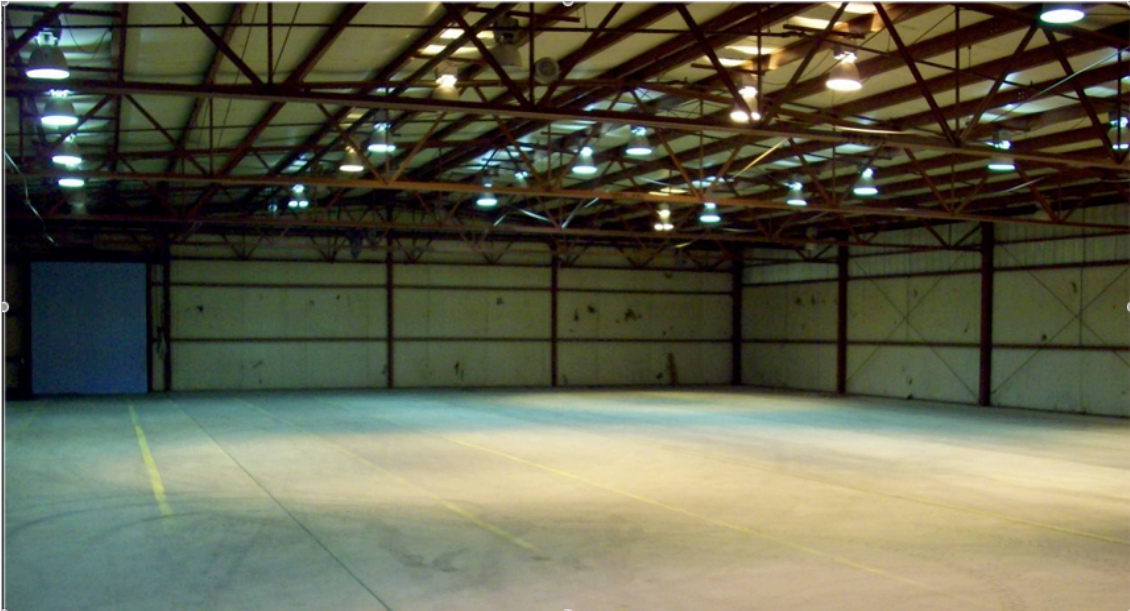
View of suite 12. It has 9,600 SF of available space with 18' center ceiling height.