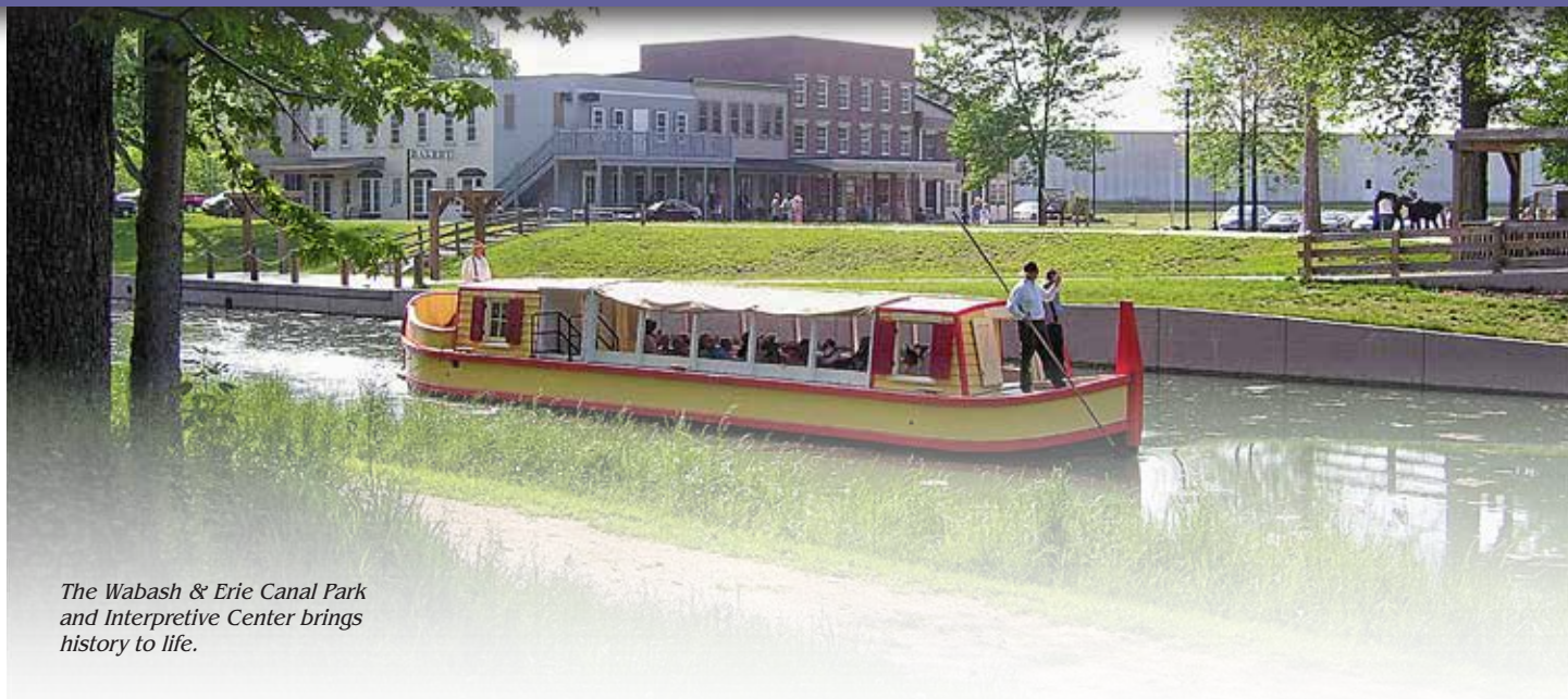
The Wabash & Erie Canal Park and Interpretive Center brings history to life.