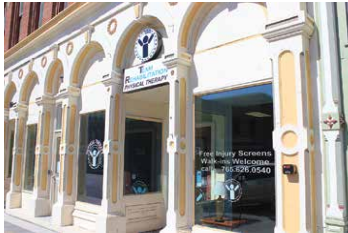
Team Rehabilitation located in Delphi.