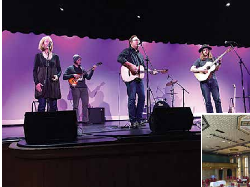
Performances and private bookings at the Delphi Opera House draw big crowds.

Camden Tractor Pull, Canal Days, Flora Community Club Midnight Madness, Old-Fashioned Christmas at the Canal and Old Settlers, bring regional visitors.