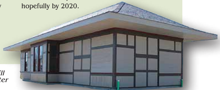
Historic depot will be welcome center and museum.

driveway going in as funds are raised. Phase III will cover interior restoration and museum space design. Numerous grants and businesses have supported the work; more will be needed before it can open, hopefully by 2020.