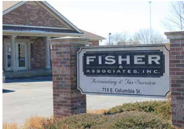
Fisher & Associates operates in Flora.