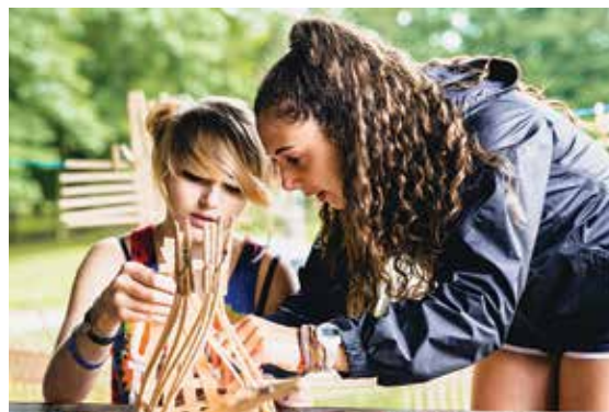
YMCA Camp Tecumseh offers programs and events.

An indoor/outdoor educational, recreational and religious program facility on 600 acres, YMCA Camp Tecumseh draws about 35,000 youth and adults each year for day-long and extended-stay educational programs.