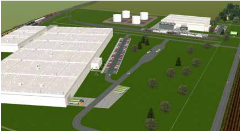
Camden Recycling and Green Partners will build facilities near Camden.

Planning, marketing and industrial park developments came together in 2016, setting Carroll County on a course lined with capital investments, new jobs and growth.