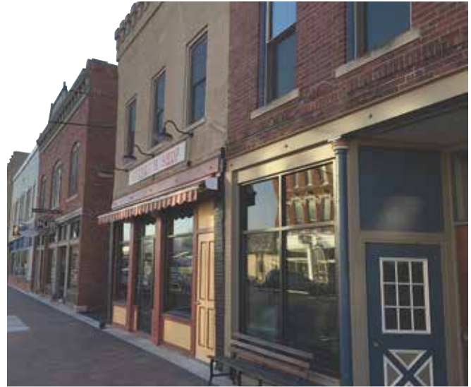
Downtown Delphi benefitted from a state grant that covered facade renovation.

The project also included a two-phase Washington Street Gateway Trail—a new, urban multi-use trail along the west side of Washington Street from Columbia to Clay streets. Elements included asphalt trail, curb ramps, connecting