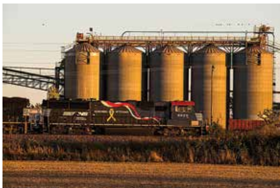
The Andersons, Delphi, is a key agribusiness.